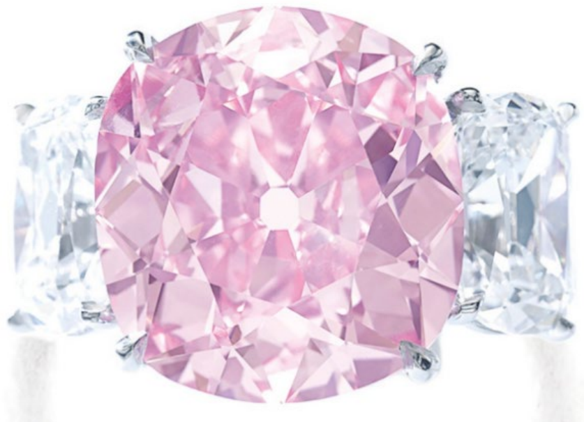
Above: the 9-carat cushion-shaped Clark Pink