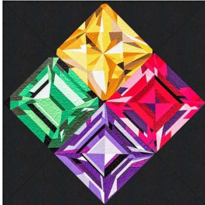
4 Gems – WITHOUT Sashing

Dimensions: 51" x 51" WITHOUT Sashing; 52" x 52" WITH Sashing