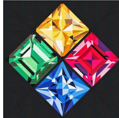
4 Gems – WITH Sashing