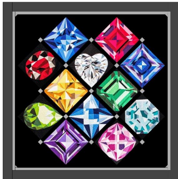
12 Gems on Point – Queen