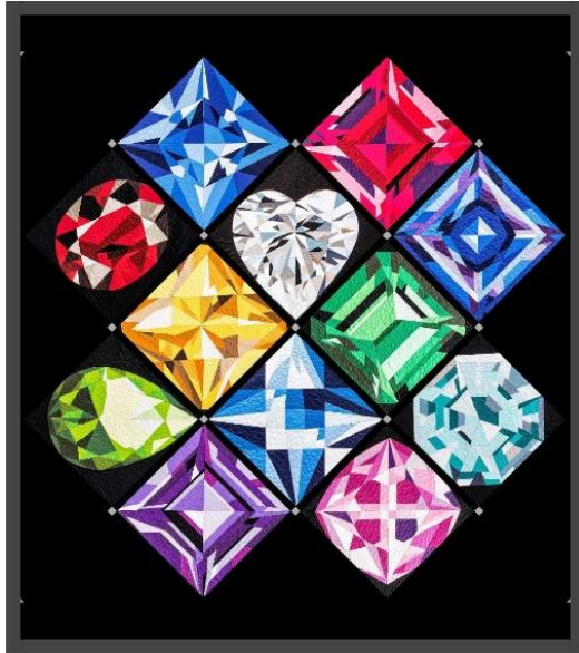
12 Gems on Point – Double

Dimensions: Double - 80" x 90"; Queen - 93" x 93"